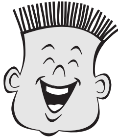
Gotta joke for ya!

Duane sends an E-mail from school to his friend in another school. In it, he repeats a joke containing rude language that he heard on a TV show.